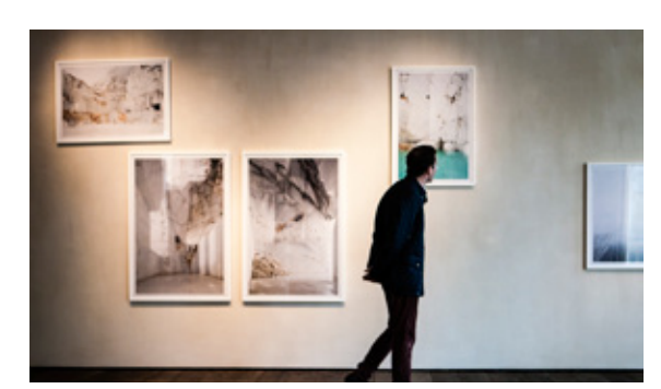
middle: luxury appartement - below right: 'the gallery'

About Vastned Retail Belgium. Vastned Retail Belgium is a public regulated real estate company (RREC), the shares of which are listed on Euronext Brussels (VASTB). Vastned Retail Belgium invests exclusively in Belgian commercial real estate, focusing on premium city high street shops (prime retail properties located on the best shopping streets in the major cities of Antwerp, Brussels, Ghent and Bruges). Furthermore Vastned Retail Belgium owns real estate properties in high street shops (city centre shops outside of the premium cities) and non-high street shops (high-end retail parks and retail warehouses). The RREC intends to achieve a 75% investment ratio in high street shops in due course.