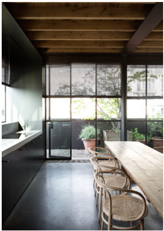
above: restaurant - below: luxury appartement

Graanmarkt 13 is a house with a soul, which is what the owners of the brand have in mind. Downstairs, people can indulge in lunch or dinner with Chef Seppe Nobels's cuisine while also enjoying the sight of the restaurant's garden where vegetables are eagerly harvested. People can also find unique fashions and objects on the ground floor. Just one floor up is a beautiful, open space in which exhibitions are organised or where exclusive presentations, launches or private meals can be held. The top floors feature a luxury apartment, which is steeped in a uniquely homey context with customised hotel service. In short, it's an exceptional place to be. The management and development of the Graanmarkt 13 brand will remain entirely under the aegis of the current owners.